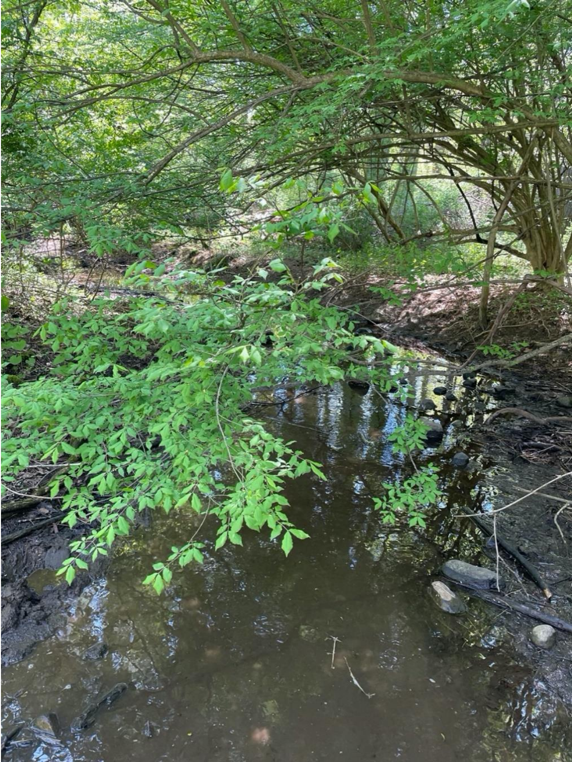
Photograph HK3: A photograph of the site conditions of the Hackettstown Armory Musconetcong River Tributary taken on May 6, 2021. This photograph is a middle portion of the stream segment that was representative of the majority of the GLIN survey area.