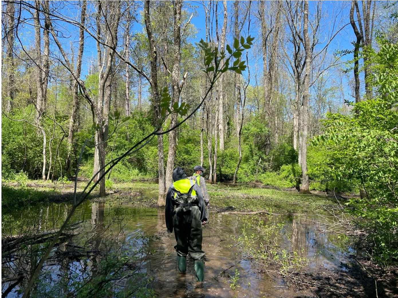
Photograph HK2: A photograph of the site conditions of the Hackettstown Armory Musconetcong River Tributary taken on May 6, 2021. This is a photograph of a swamp area in the middle portion of the stream segment that was different from most of the survey area. It had shallow, stagnant water that had some small vegetation and banks that could be potential basking areas for GLIN.