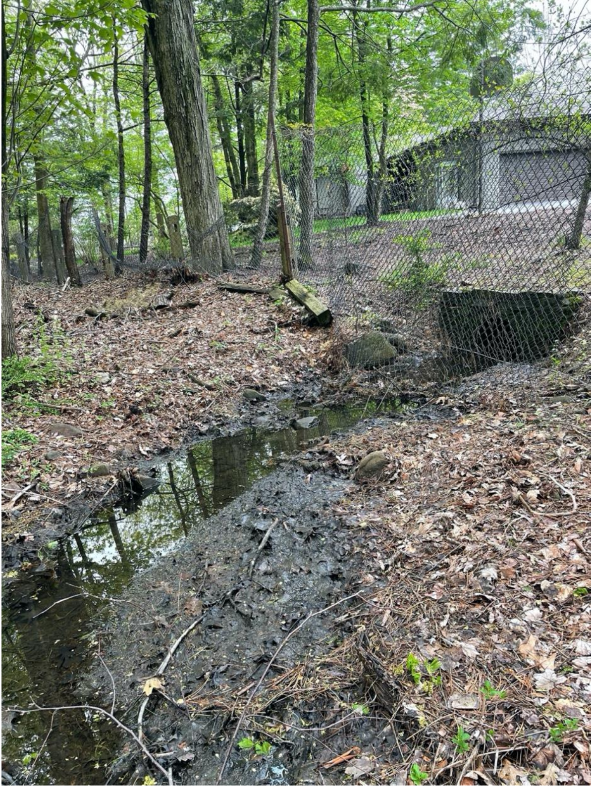
Photograph WO6: A photograph of the site conditions of the West Orange Bear Brook Tributary taken on May 4, 2021. This photograph shows the end segment (upper bounds of the left fork) of the survey area which was a cement culvert.