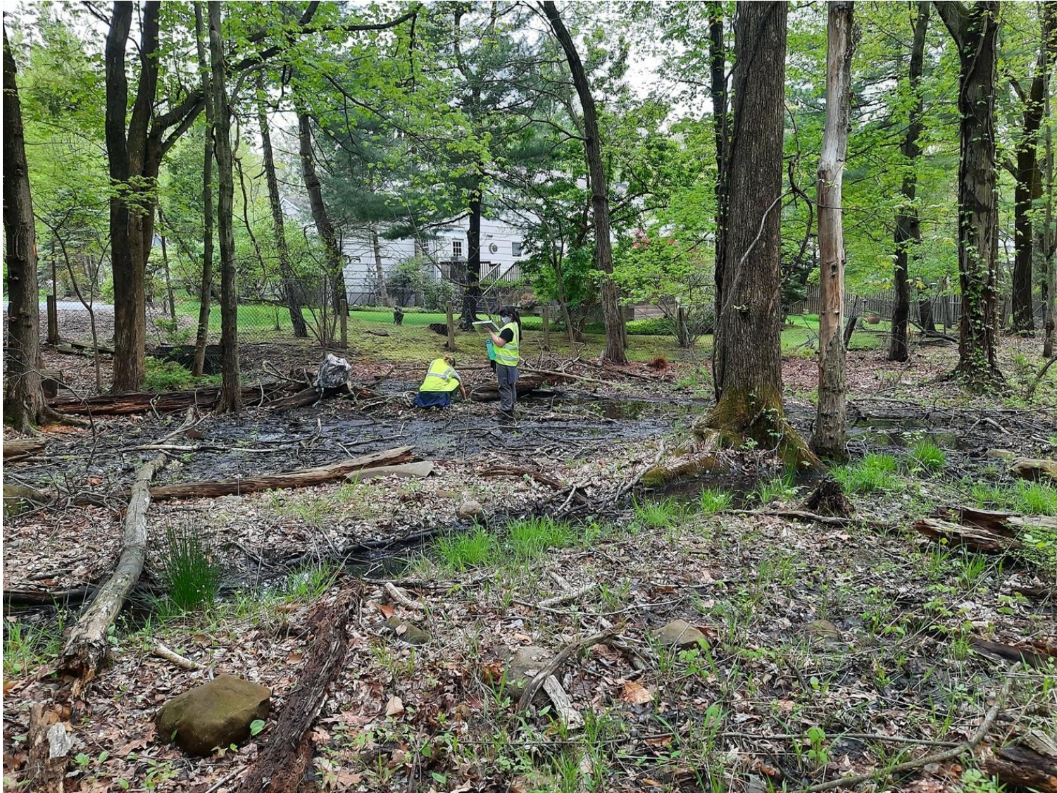
Photograph WO7: A photograph of the site conditions of the West Orange Bear Brook Tributary taken on May 4, 2021. This photograph shows the conditions of the end survey area (upper bounds of left fork).