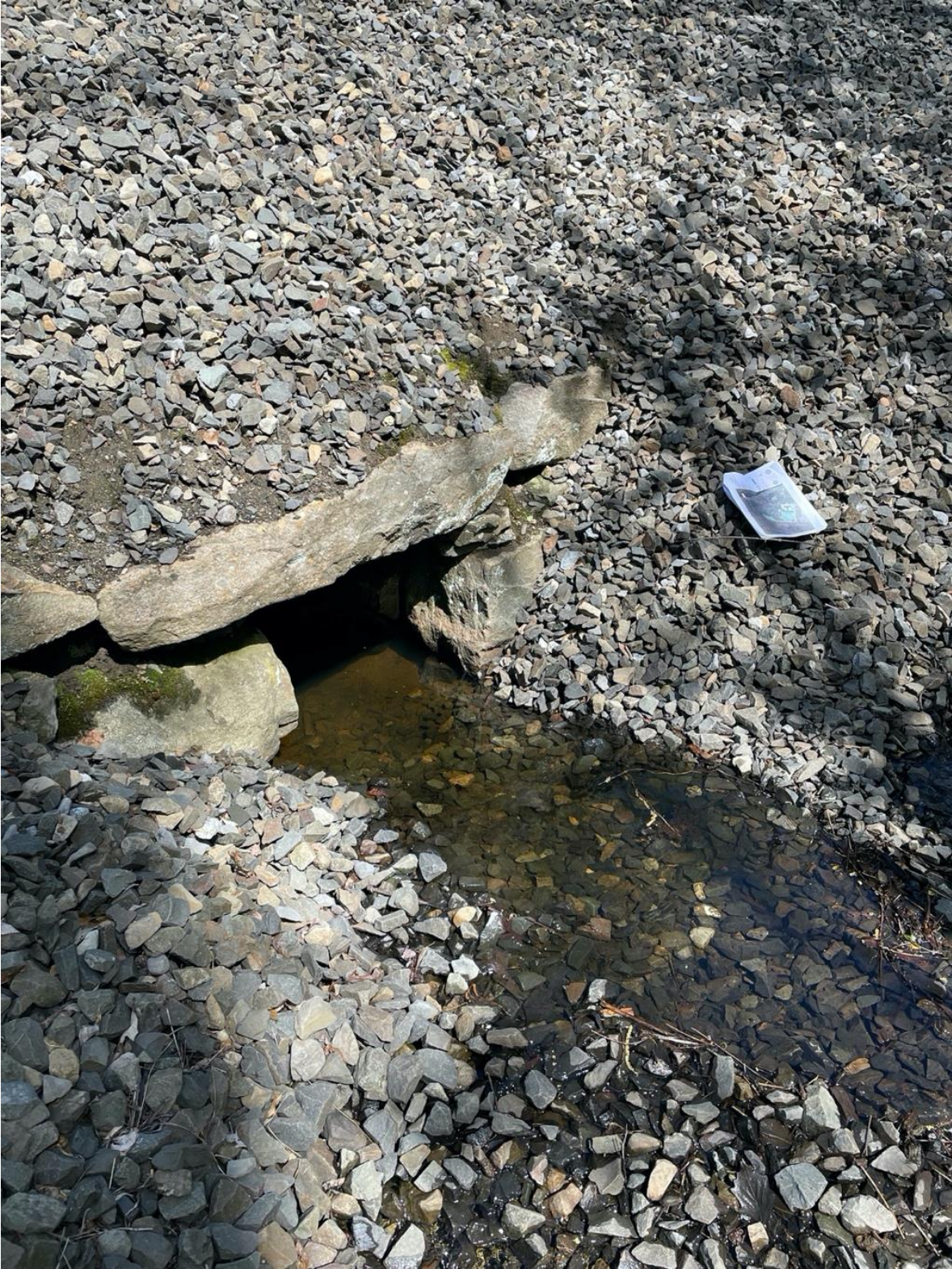
Photograph HK6: A photograph of the site conditions of the Hackettstown Armory Musconetcong River Tributary taken on May 6, 2021. This photograph is an image of the end of the stream segment (upper bounds) that was surveyed.