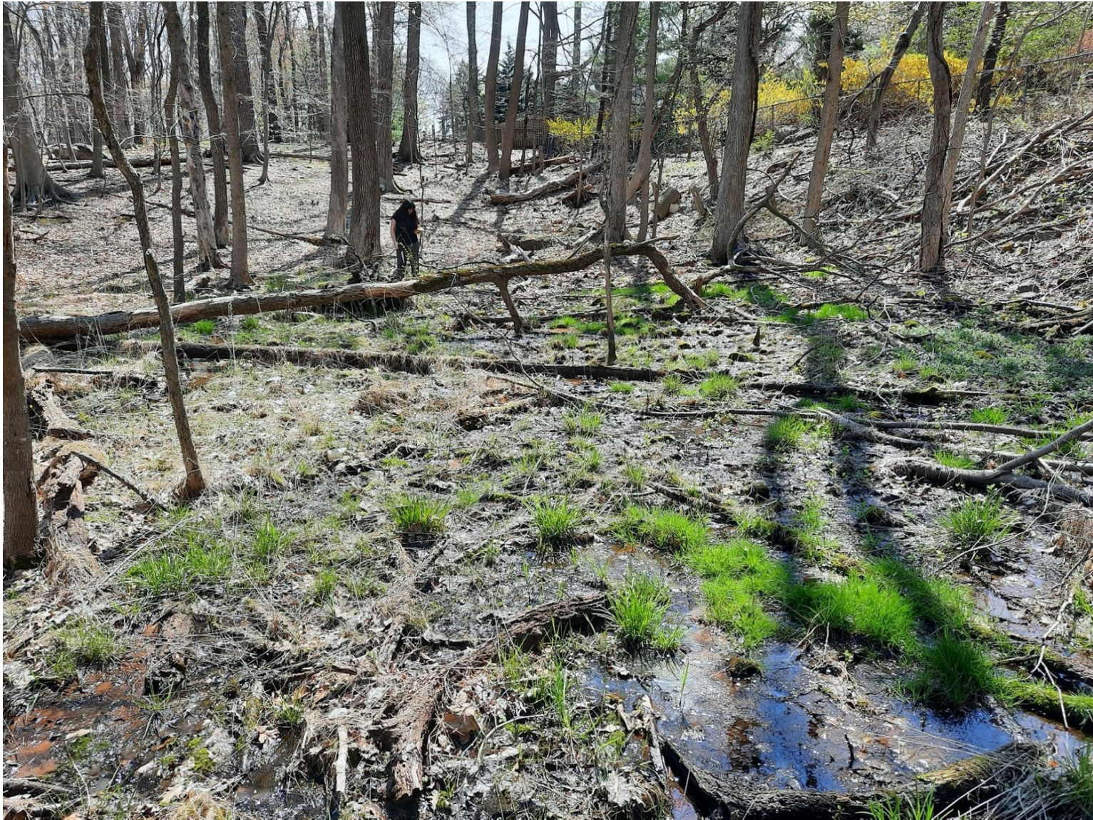
Photograph WO5: A photograph of the site conditions of the West Orange Bear Brook Tributary taken on May 4, 2021. This photograph shows the conditions of the end stream segment (upper bounds) of the right fork.