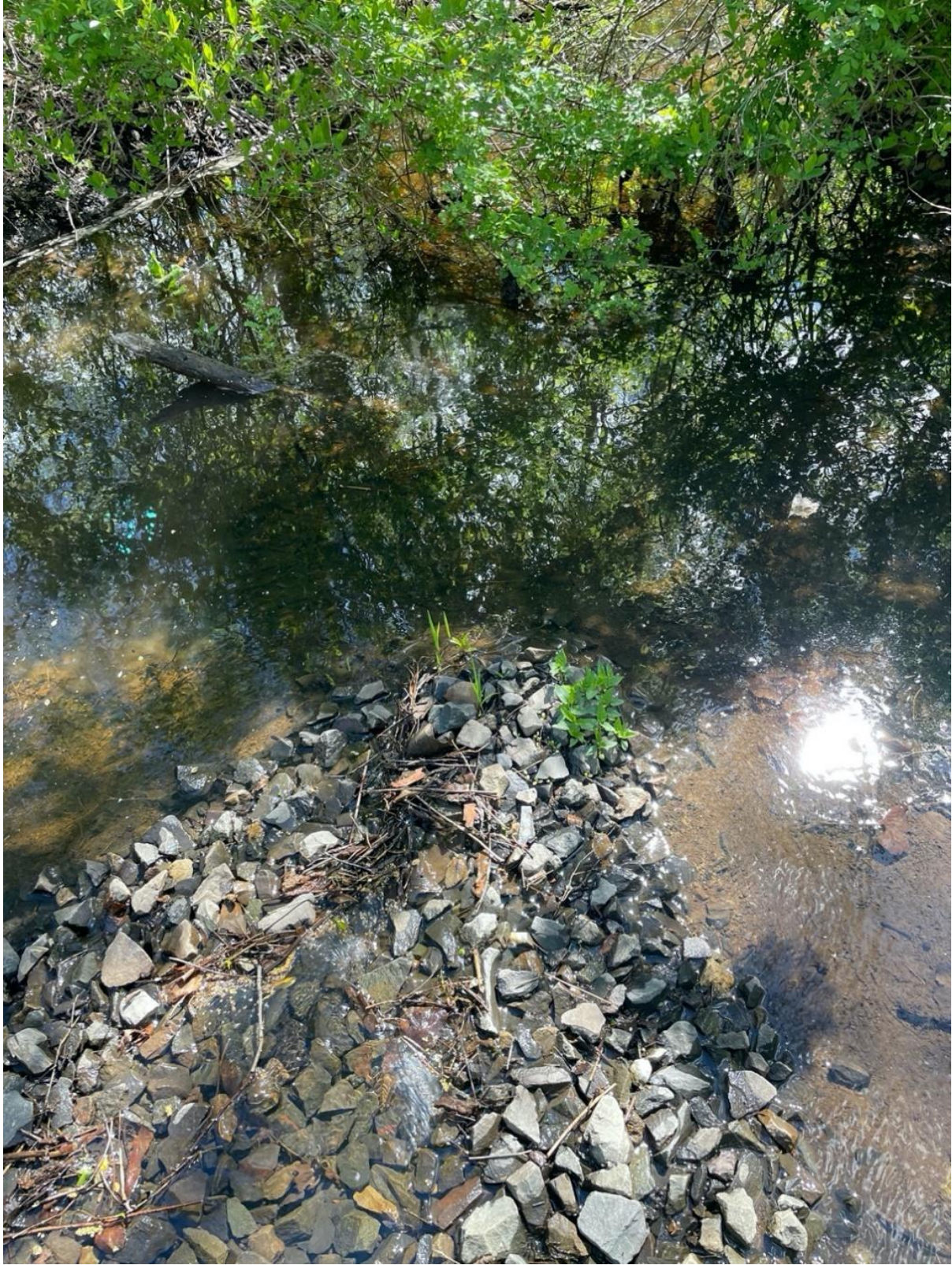
Photograph HK5: A photograph of the site conditions of the Hackettstown Armory Musconetcong River Tributary taken on May 6, 2021. This photograph shows the end stream conditions (upper bounds).