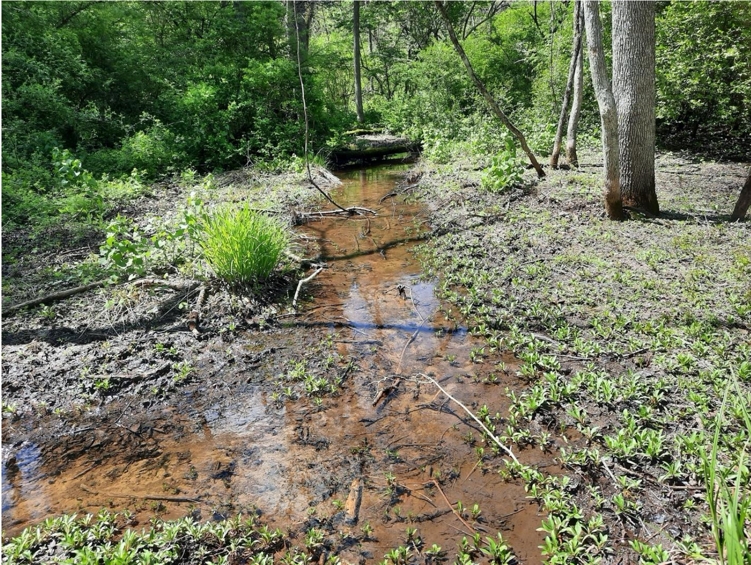
Photograph HK4: A photograph of the site conditions of the Hackettstown Armory Musconetcong River Tributary taken on May 6, 2021. This photograph was a middle area of the stream.