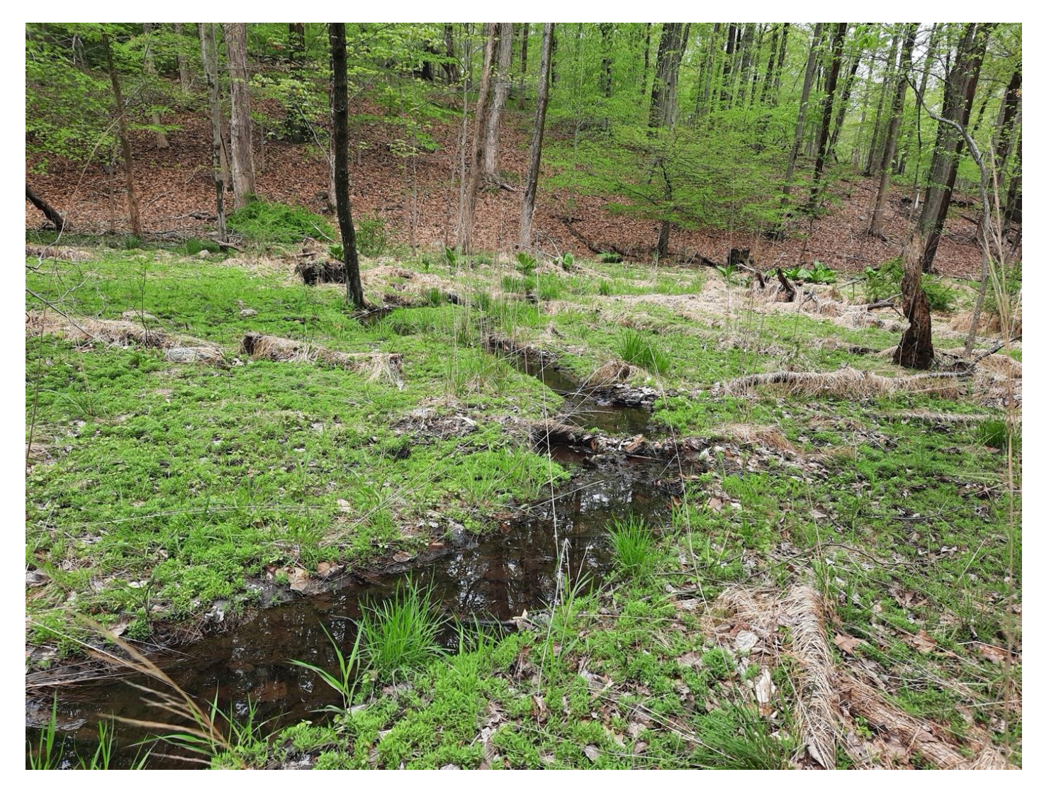
Photograph WO4: A photograph of the site conditions of the West Orange Bear Brook Tributary taken on May 4, 2021. This photograph shows the conditions of the stream segment of the right fork.