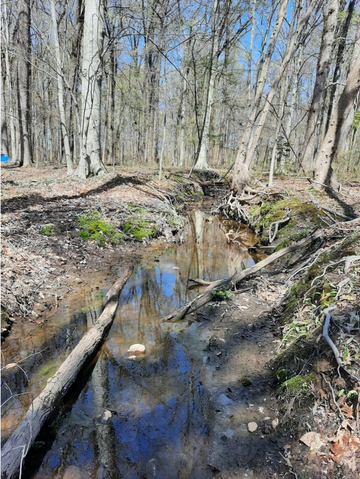
Photograph LVS3: A photograph of the Lawrenceville NJDMAVA Shabakunk Creek Tributary on April 13, 2021. This photograph shows the site conditions of a middle portion of the surveyed stream segment.