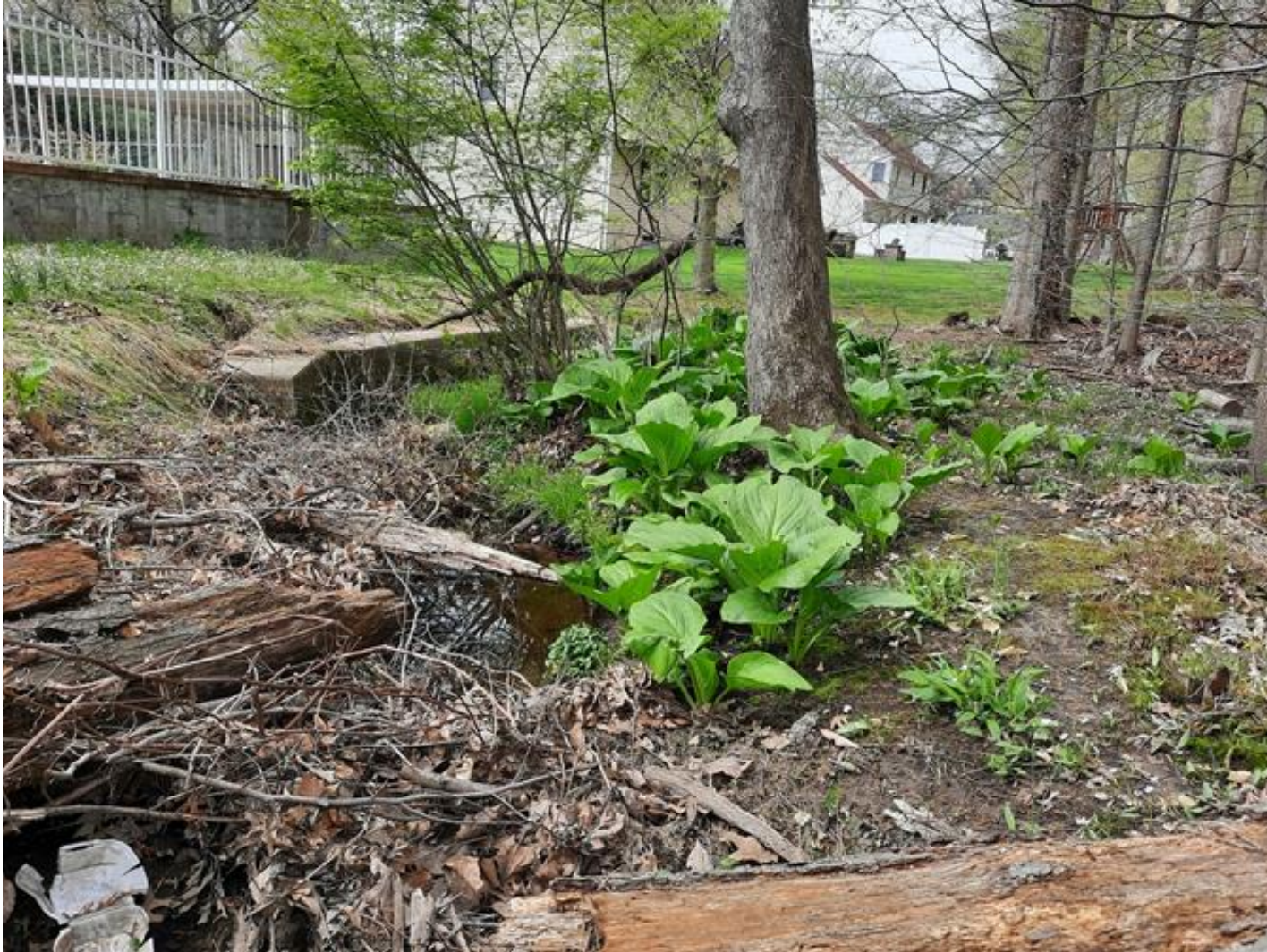
Photograph LVS1: A photograph of surrounding area to the survey area of the Lawrenceville NJDMAVA Shabakunk Creek Tributary taken on April 19, 2021. This photograph shows the site conditions of the beginning portion (lower bounds) of the surveyed stream segment.