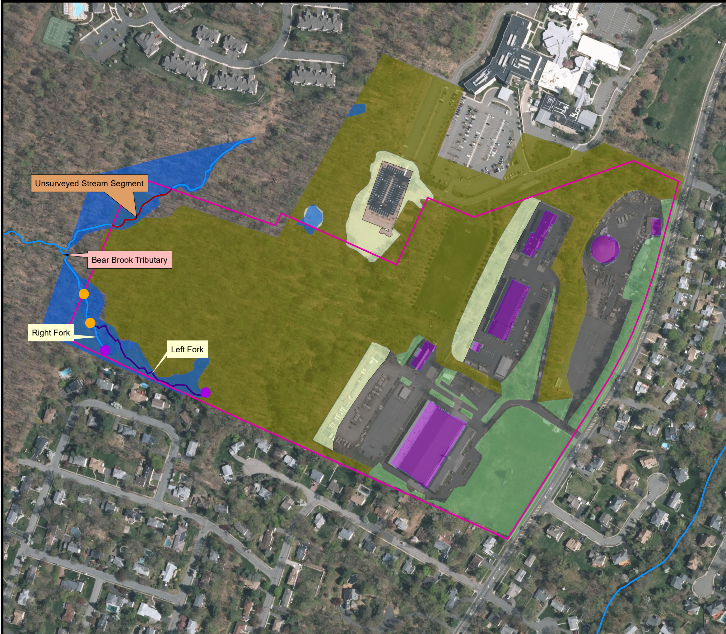
Figure WO1 Wood Turtle Survey Site: West Orange Armory 2021