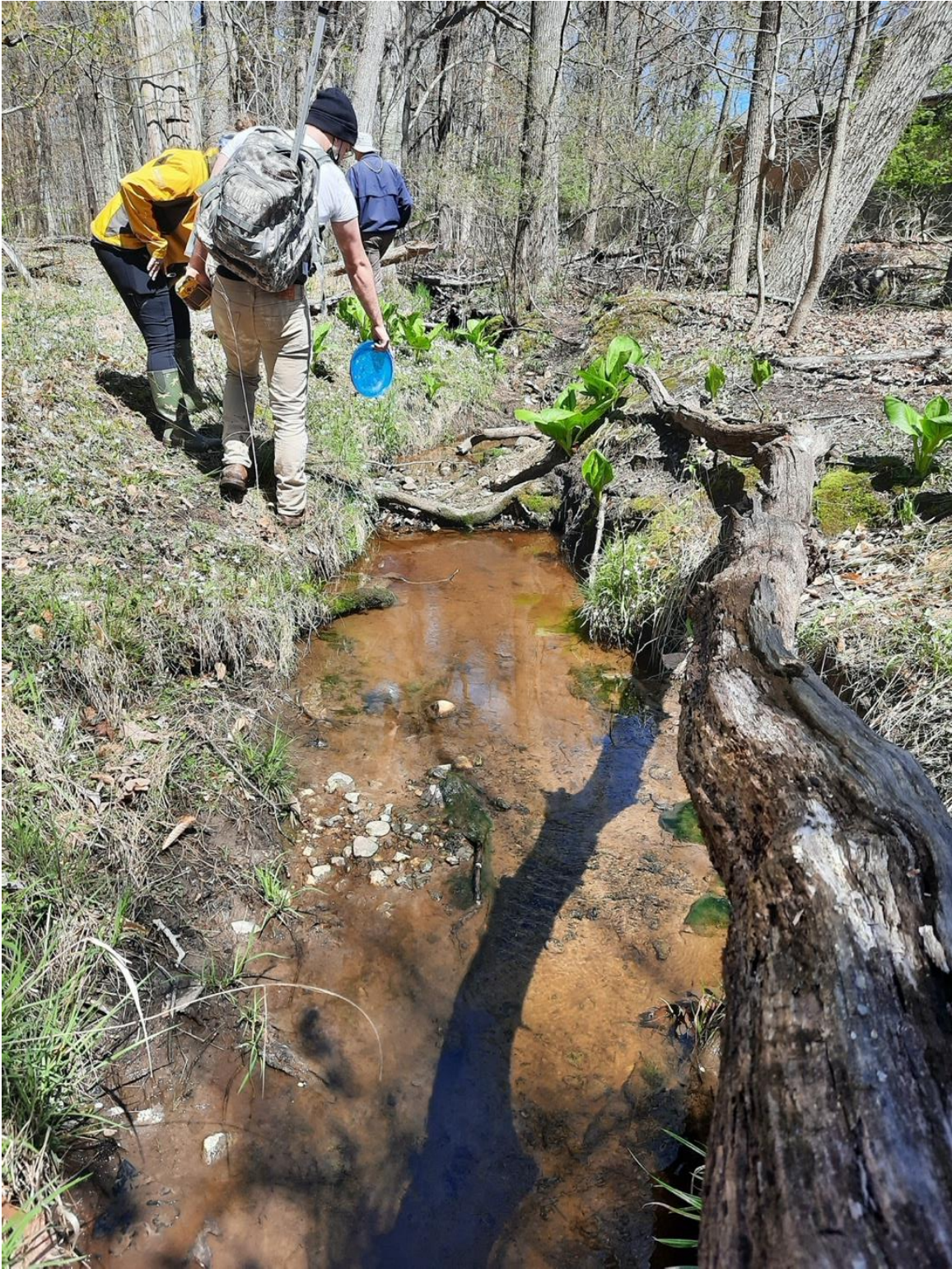
Photograph LVS2: A photograph of the site conditions of the Lawrenceville NJDMAVA Shabakunk Creek Tributary on April 13, 2021. This photograph shows the site conditions of a middle portion of the surveyed stream segment.